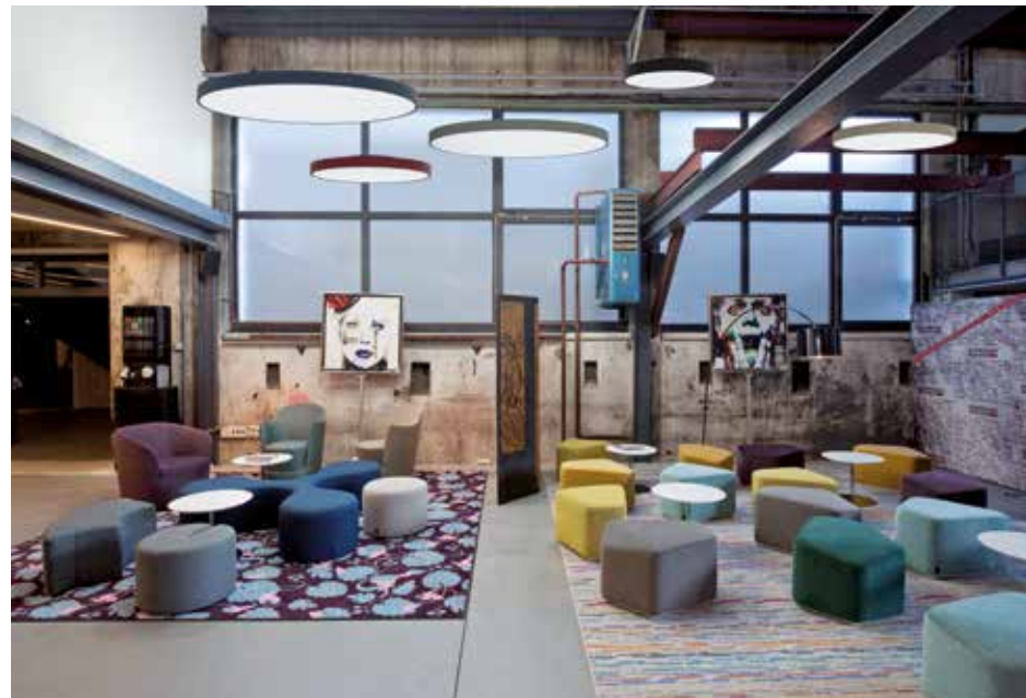
PROJECT GUSSWERK / SALZBURG

BIDO is a round affair: According to the number of luminaires, their sizes, the trendy colour scheme and how it is installed, the series of luminaires is able to dominate a big space, define it and draw the focus upwards. At the same time, BIDO can also be used in a decent way and float elegantly from the ceiling.