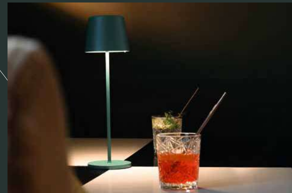
MOLTO LUCE AESTA

The same goes for light in the room. Just like a master chef immediately knows that a pinch of salt is missing, some sweetness or just a little spiciness, we at Molto Luce know exactly which kind of illumination brings off a room. After all, light is our passion which we work with every day.